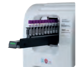
Test 1 BCL Code SI 195.220/BCL

Up to 60 samples per session with ALIFAX green plastic racks. Up to 48 samples per session with Beckman Coulter CBC racks Beckman Coulter Series LH 750.