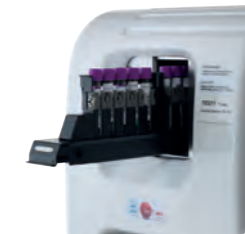
Test 1 MDL Code SI 195.250/MDL

Up to 40 samples per session with ALIFAX blue plastic racks. Up to 40 samples per session with Siemens CBC racks Siemens Series ADVIA.