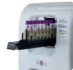
Test 1 SDL Code SI 195.230/SDL

Up to 60 samples per session with ALIFAX green plastic racks. Up to 48 samples per session with Beckman Coulter CBC racks Beckman Coulter Series LH 750.