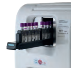
Test 1 XDL Code SI 195.260/XDL

Up to 40 samples per session with Beckman Coulter CBC racks Beckman Coulter Series LH 500.