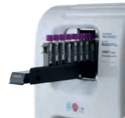
Test 1 YDL Code SI 195.240/YDL

Up to 40 samples per session with ALIFAX blue plastic racks. Up to 40 samples per session with Sysmex CBC racks Sysmex Series XE.